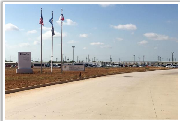
South Texas Family Residential Facility

We will begin our week at a mandatory orientation on the evening of Sunday, November 4. We will then report to the facility Monday morning and provide support for 14-18 hours per day through Friday. Volunteers must commit for the entire week. The facility is located approximately 80 miles from San Antonio and currently houses approximately 1,000 mothers and children. This will be a life-changing experience that is sure to be rewarding.